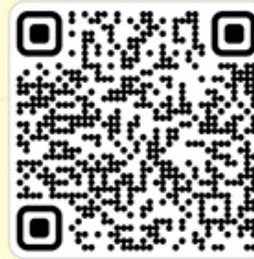
Scan for Location